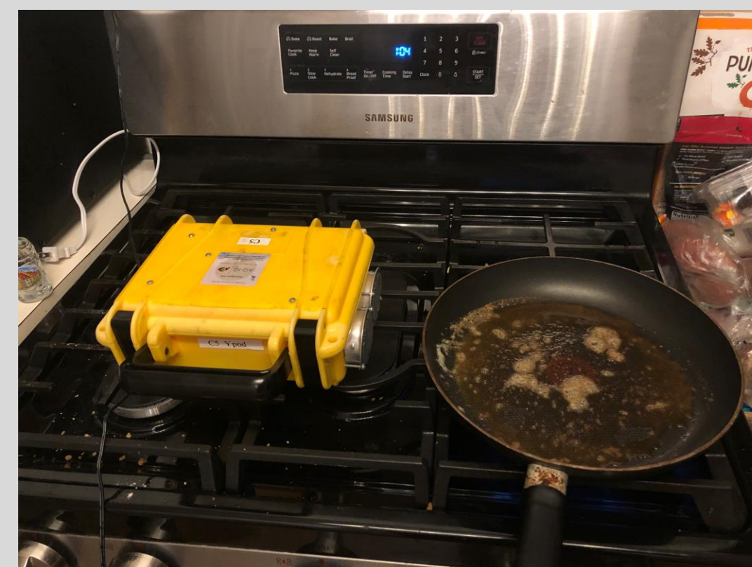
Figure 1: POD Air Quality Monitor next to burning butter

While cooking, many people do not think about the potential problems of using different cooking oils. There are so many indoor pollutants, it is important to be careful to try to minimize these. There are certain temperatures for the smoke points for different cooking oils. In this experiment butter and olive oil were compared.