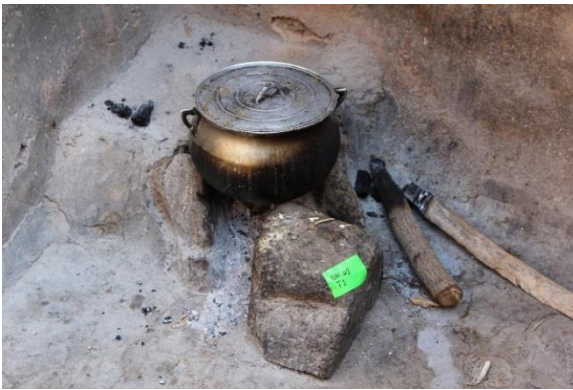
Traditional cook stove.

A cook stove intervention study involves identifying a group of participants and providing some of them with improved cook stoves, while the rest of them continue to use traditional cook stoves . Researchers then collect data to determine the benefits of improved stoves over traditional stoves, as well as the barriers to widespread implementation. Improved cook stoves must lower harmful emissions and be cost effective and easy to use. These studies can be complex because researchers need to study the problem from many different angles.