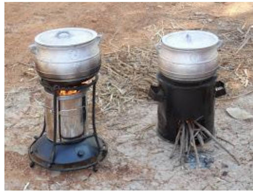
Improved cook stoves: (left) high-cost and (right) low-cost.

Imagine that you have been awarded a grant to conduct a cook stove intervention study to investigate the impact of different stove types. You randomly sort 200 identified homes into groups; some homes will continue to use traditional methods while other homes will use the improved cook stoves. Use the template below as a guide to plan how you would conduct this study.