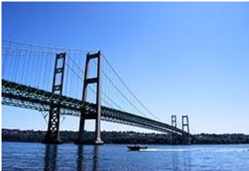
The new Tacoma Narrows Bridge.

The original Tacoma Narrows Bridge was the first suspension bridge built across the Puget Sound in Washington. The bridge was strong but relatively light, narrow, and as it turns out—